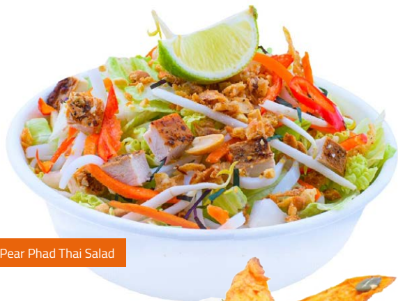
Pear Phad Thai Salad