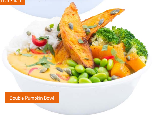
Double Pumpkin Bowl