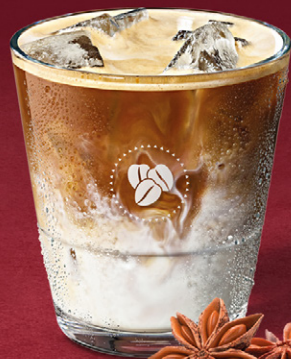
Matcha-aníz iced latte